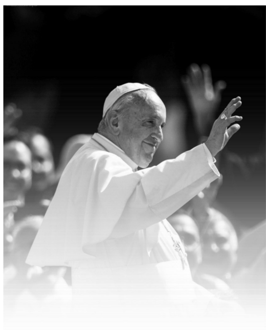
POPE FRANCIS REQUIESCAT IN PACE

Holy Father, Pope Francis, may you rest in Peace and Rise in glory.