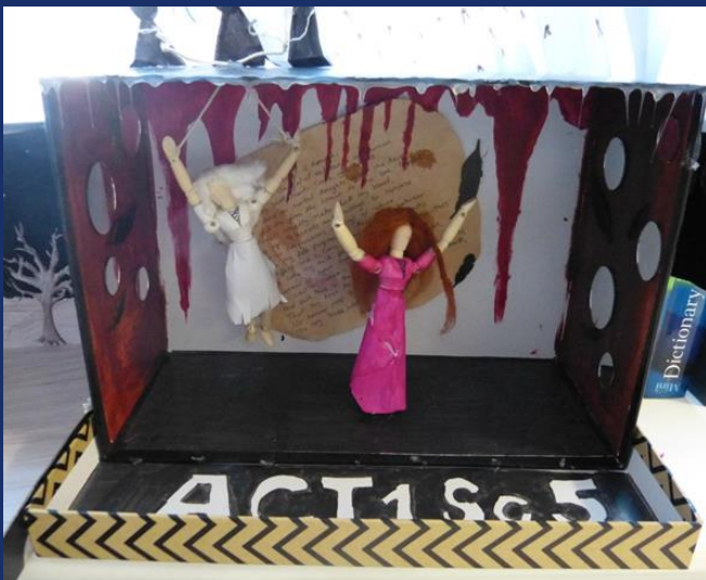
Shoe box theatres Learning about Macbeth