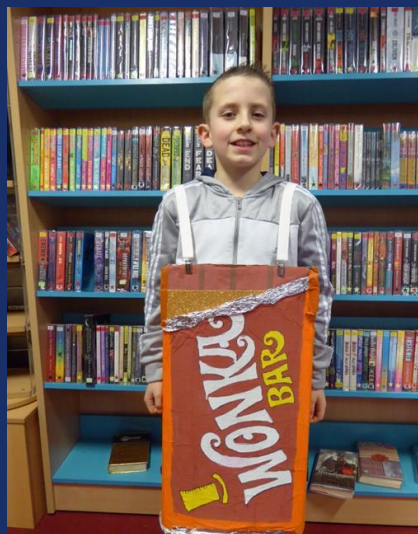
World Book Day- a human Wonka bar!